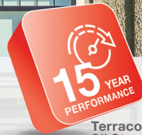
Terracoat Sil Standard