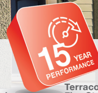
Terracoat Flex Standard