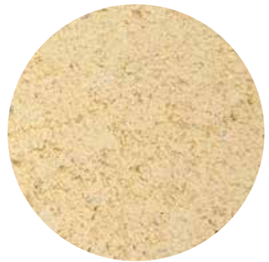
Colour: MCT-413 Application: