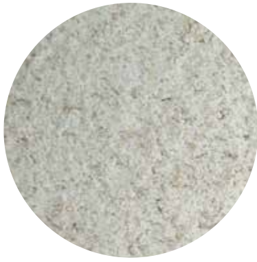
Colour: MCT-410 Application: