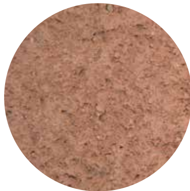
Colour: MCT-201 Application: