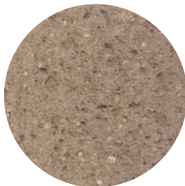
Colour: MCT-801 Application: