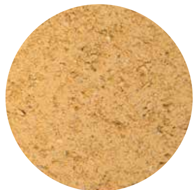
Colour: MCT-416 Application: