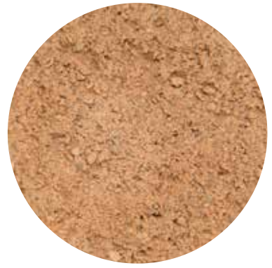
Colour: MCT-423 Application: