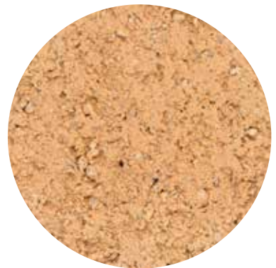
Colour: MCT-421 Application: