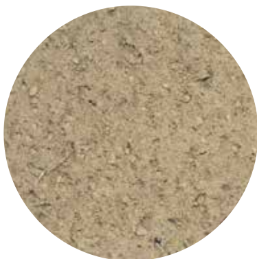
Colour: MCT-701 Application: