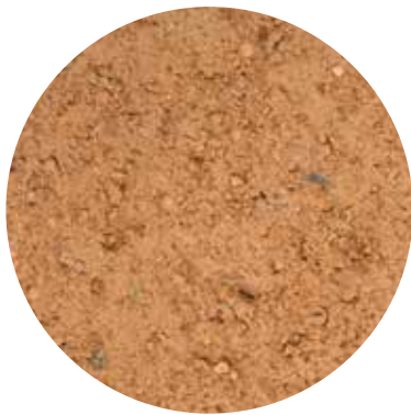
Colour: MCT-429 Application: