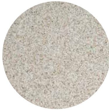
Colour: MCT-331 Application: