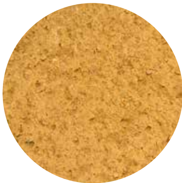
Colour: MCT-419 Application: